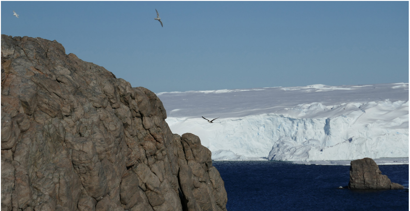
Fig. 2. Long-tailed Skua Stercorarius longicaudus (centre of the picture) observed in Terre Adélie, off the coast of Antarctica, above Mont Joli (left). The Astrolabe glacier (background) and Lamarck Island's characteristic Donjon (right) are also visible. Several Snow Petrels Pagodroma nivea are visible on the top left.