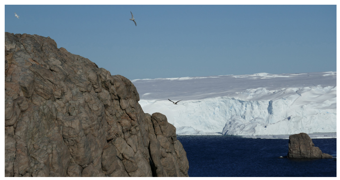
Fig. 2. Long-tailed Skua Stercorarius longicaudus (centre of the picture) observed in Terre Adélie, off the coast of Antarctica, above Mont Joli (left). The Astrolabe glacier (background) and Lamarck Island's characteristic Donjon (right) are also visible. Several Snow Petrels Pagodroma nivea are visible on the top left.