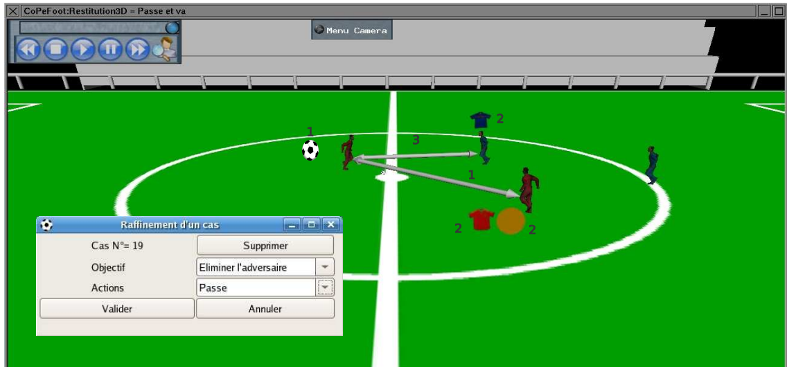
Figure 2: Representation of an agent's perceptions in context: exocentric perspective.

2) Second level: the computational model is enhanced through use. Within CoPeFoot, an interaction is proposed: the users click on the zones of the context they find relevant. Contextual information is reified by symbols indicating distance from the target, teammates and opposition players; symbols indicate whether or not teammates are marked or open.