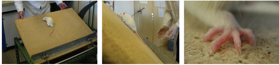
FIGURE 1: The tilting board apparatus.