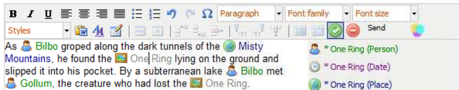
Fig. 6. The WYSIWYG editor in the WissKI system

E5 Event that [P7] took place at under the Misty Mountains and [P4] has time-span 1341. Each fact can be represented by a semantic association, e.g. relating One Ring with 1341 is the path One Ring.P30i custody transferred through. Bilbo took the One Ring possessed by Gollum.P10 falls within. Gollum met Bilbo.P4 has time-span.aTime-span.P1 identified by.anAppellation.P3 has note.1341. Paths are instances of constructs (called “ontology paths” in the WissKI system) which act as stencils for the data. For instance, the ontology path between One Ring and 1341 is E22.P30i.E10.P10.E5.P4.E53.P1.E41.P3.E62.