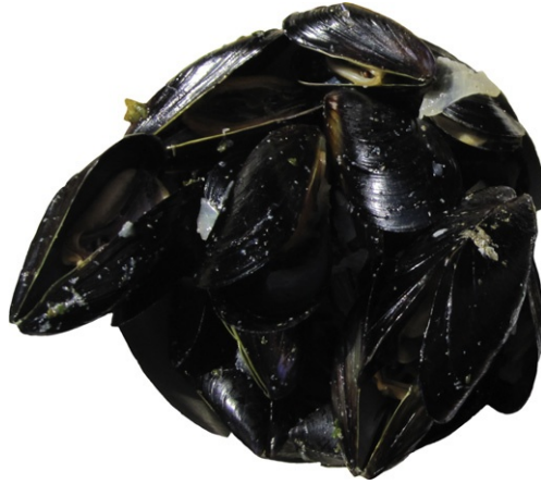
Figure 14.1 A bowl of steamed mussels, Mytilus edulis . Edible bivalves, especially cooked wild bivalves such as mussels, oysters and clams, are some of the most nutritious foods for humans on the planet.

severe mental decline, not from the human genome project, but from nutrition and health management. The view of diet being a major driver of health and disease dates back to Sir Robert McCarrison's studies in India, early last century. Eating adequate amounts of foods rich in bioavailable brain nutrients, for example, shellfish 1 , such as mussels (Figure 14.1) and oysters (which contain nutrients including protein, docosahexaenoic acid (DHA), arachidonic acid (AA), iodine, iron, copper, zinc, manganese, and selenium as well as a variety of antioxidants including vitamins; see Table 14.1) promotes health and helps prevent diet-induced mental ill health today (e.g., Robson, 2009). This overview highlights the major changes that are urgently needed in order to promote health and help prevent the epidemic of mental ill health (for an overview of preventing non-communicable diseases, see Robson, 2013b). After all, disease prevention, in the long run, is far less costly than treatment.