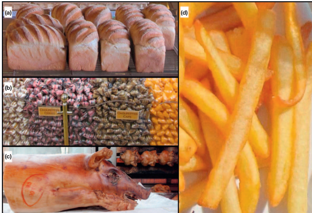
Figure 25.2 Examples of widely consumed modern foods with both a high-energy-density and a low-nutrient-density: (a) bread, (b) boiled sweets, (c) domesticated pig and chicken intensively reared on an unnatural diet that is both high-energy-dense and a low-nutrient-dense, and (d) French fries.