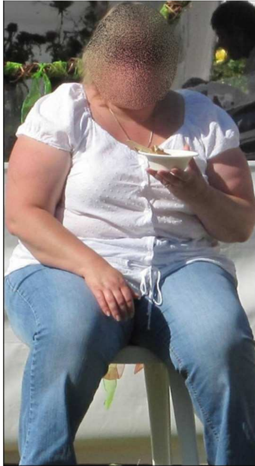
Figure 25.1 An obese person eating high-energy-dense processed food. It is an inescapable fact that consuming more calories than is needed results in weight gain, even if there is genetic variation between one person and the next (Anthony A. Robson ©).

statistics may be underestimated (see obesity statistics above). Once considered a problem only in high-income countries (World Bank classification: http://data.worldbank.org/about/country-classifications ), the prevalence of overweight and obese people is now dramatically on the rise in low- and middle-income countries, particularly in urban settings where exercise is optional and high-energy-dense ( >2 \text{ kcal g}^{-1} – Ledikwe et al., 2006) fast food is now plentiful (Figure 25.2). Yet, inflammatory diseases and brain disorders are rare or nonexistent in hunter-gatherers eating a late Paleolithic diet, that is, a low-energy-dense diet with a wild plant-to-animal energy intake ratio \sim 1:1 , with fish and shellfish providing a significant proportion of the animal component (see Eaton et al., 2010).