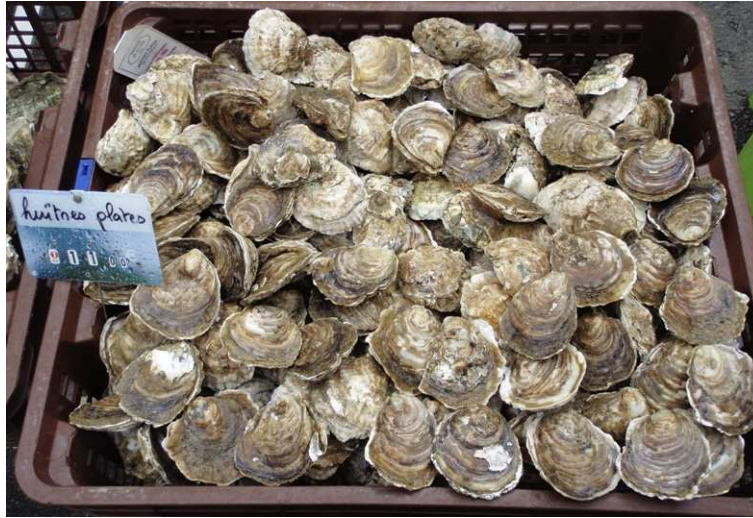
Figure 25.4 Oysters, Ostrea edulis , for sale at a French market. Oysters, especially cooked wild oysters, are both low-energy-dense and some of the most nutritious foods for humans on the planet. However, they lack the fiber found in plants.

(increased surface area in contact with taste and smell receptors) to edible composites (Ultrafine food technology: Eminate Limited, Nottingham, United Kingdom). Durethan ® KU2-2601 packaging film produced by Bayer Polymers, Germany, is a nanocomposite film enriched with silicate nanoparticles which is designed to prevent the contents from drying out and prevent the contents coming into contact with oxygen and other gases. Durethan ® KU 2-2601 can prevent food spoilage (Neethirajan and Jayas, 2011) and thus the water content of dehydrated plant-based food products can be increased without reducing product shelf life. Therefore, nanocellulose is expected to be widely used as a nature-based food additive (Chang, et al., 2012; Klemm, et al., 2011).