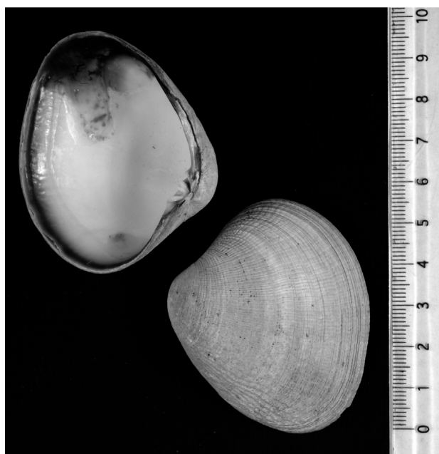
Fig. 2. Ruditapes philippinarum . Manila clam from Seløy, Norway, with characteristic brown ring symptoms showing recovery (shell repair stage = 2.5) on the inner shell surface. Scale bar is in cm

10^6 CFU ml -1 . In one clam, a similar abundance of bacteria to the extrapallial fluid was found in the mantle ( 3 \times 10^4 CFU g -1 ). After using selective methods, i.e. growth on thiosulfate citrate bile sucrose (TCBS) agar, mannitol, temperature of 30°C, agglutination tests and species-specific primed (SSP)-PCR identification, only 1 strain fulfilled the criteria defined for Vibrio tapetis . This strain was isolated from a plating of extrapallial fluid from 1 clam collected in May 2003 showing signs of shell repair (SRS = 2.5). According to colony morphology on marine agar (MA) and MA supplemented