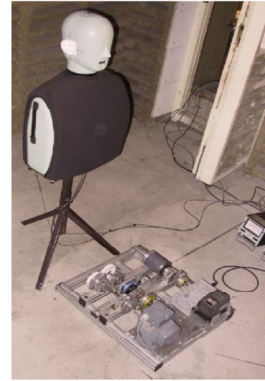
Figure 1: Acoustic dummy head placed near the test bench in order to record the 18 samples according to the experiment table.

To evaluate the influence of relevant dispersions with a relative low number of measurements, experimental designs were used. The underlying goal was to determine whether this approach, already improved for the understanding of vibro-acoustic data [2], could be consistent with the analysis of perceptive data and could generate a reliable tool for perceptive tests.