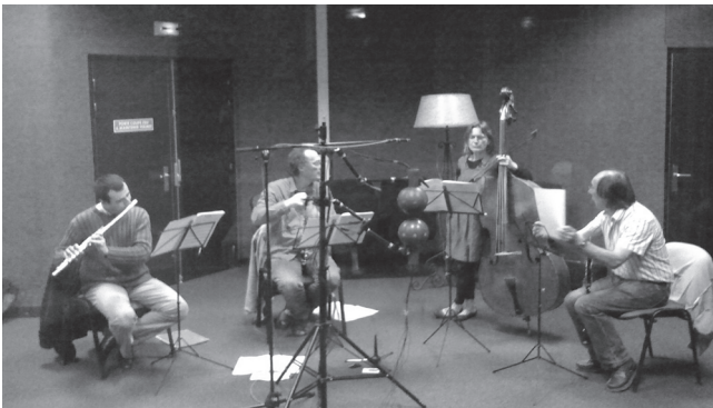
Figure 1. Microphone setup for the acquisition of the music excerpts.