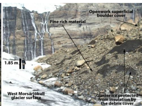
Fig. 2: The variety of material size constituting the rock avalanche deposit: clast supported on the upper layer, the deposit is enriched in fine material (gravel to coarse sand) at the contact with ice. Observers as scale are outlined on the photographs, providing scales.