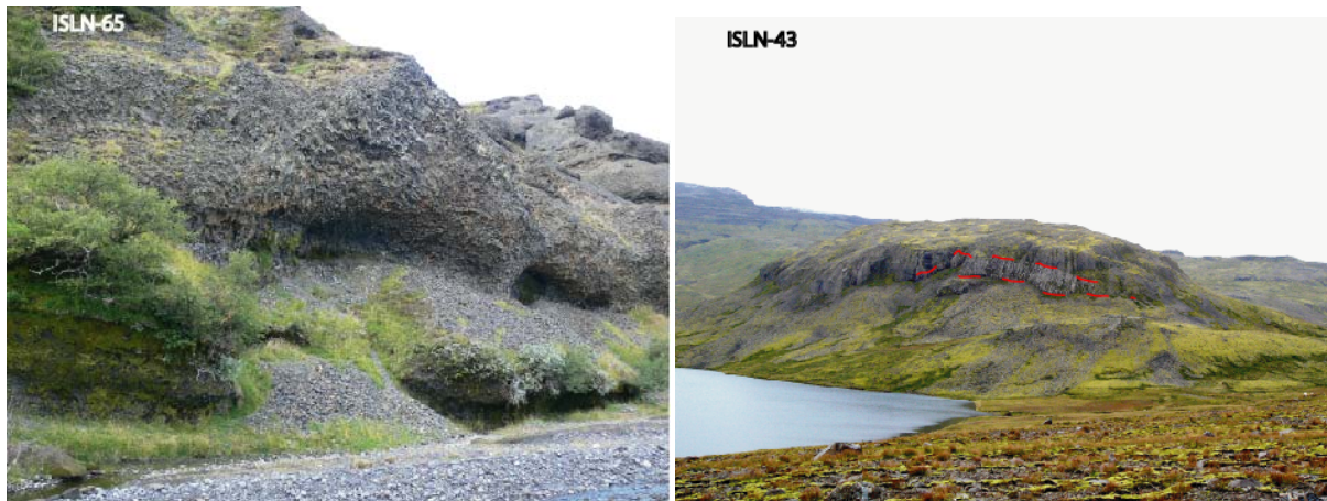
Figure 2 -Examples of sub-glacial and sub-aerial lavas. ISLN-65, Móberg Þórósfell, details on the cube jointed part of the hyaloclastite unit. ISLN-59, massive rounded block from the Uppþyppingar hyaloclastite ridge. ISLN-43, intrusion within the hyaloclastite formation of Móberg Vatnafell. ISLN-46, sub-aerial columnar jointed lava of Gerduberg. ISLN-56, upper part of a partially dismantled sub-aerial lava close to Mülaón.