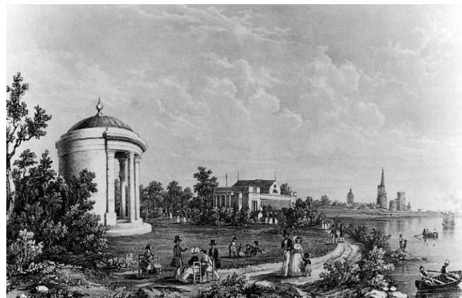
Fig. 20-3. Sea-bathing at la Rochelle, with a frontage overlooking the Mail (1841), a lithograph by Charpentier.